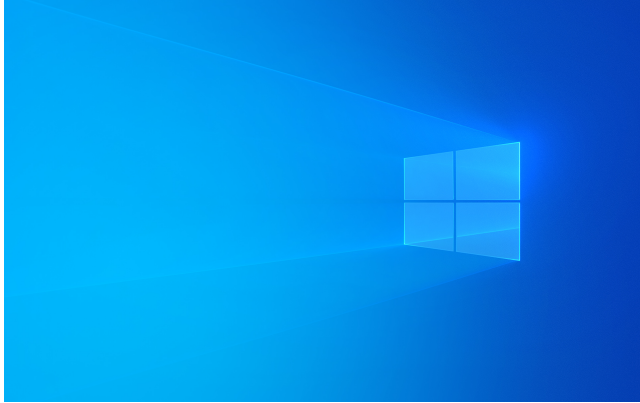
Figure 1: Default Windows 10 background.