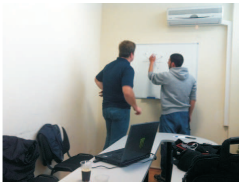
a) Consultations in Haemimont Games company

The organization of the performance is as follows. Each project lasts one semester (15 weeks). Students have a face-to-face meeting once per week and discuss the job they have done, as well as coming activities. The manager is responsible for the planning, deadlines, communication. There is a team leader, who is responsible for the technical performance—sprints and some architect functions. The job is divided according to the competences of the team members. One is responsible for algorithms, others are coders, testers, writers of documentation. Students use collaborative communication tools—usually Github. The supervisor stays behind—giving advice and directing the working process if needed; sometimes he/she plays the role of a customer. The project finishes with a public presentation (Fig. 8). Every student presents the part he/she is responsible for in the context of the whole project. Students from the same team can have different marks—this depends on their progress and presentation [1].