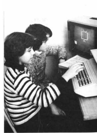
Fig. 3. In the computer lab of School 119, Sofia (one of the RGE schools)

The experiment involved 29 pilot schools, which constitute 2% of the Bulgarian K-12 schools. The main principles of RGE were learning by doing , guided discovery , and integrated school subjects . The educational materials designed expressly for the experimental schools included textbooks, teacher guide-books and the Mathematics and Informatics bulletin for teachers. Lego-Logo-based computer environments were developed and tuned to specific subject domains and oriented to the students' exploratory activities (Fig. 1–4) [14, 15]. The RGE concept allowed students to move from constructing controllable models to fully programmable microworlds and in this way to participate in building their knowledge [19].