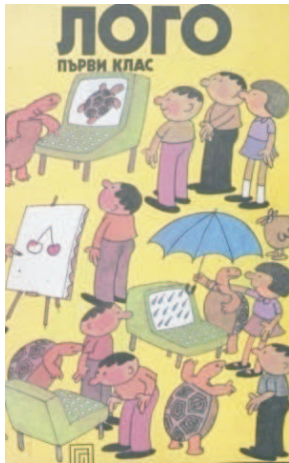
Fig. 1. The first Bulgarian Logo textbook for 5 th grade (1984, R. Nikolov)