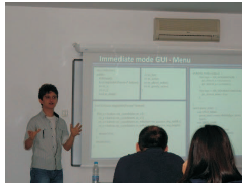
b) Public defense