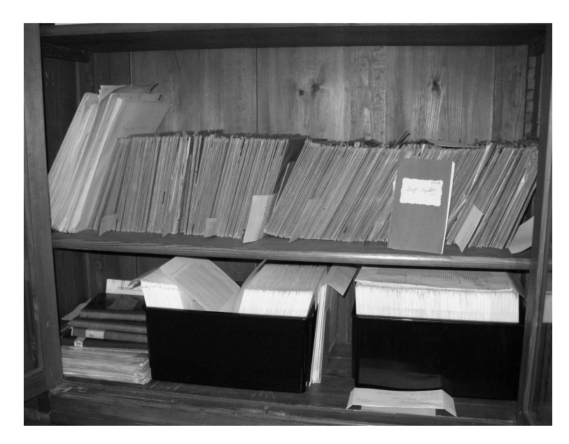
Fig. 1. View of the shelf with the Kapteyn Selected Areas plates and available logbooks in the Potsdam Library of Astronomical Photographic Plates

Stellar Clusters, Eclipsing Binary Stars, Comets and Minor Planets) by historic names as O. Lohse, J. Scheiner, J. Hartmann, E. Hertzsprung, K. Schwarzschild, G. Eberhard, etc. The plate collection also reflects the history and development of the Potsdam Observatory, e.g., the observatory was the base for testing new astronomical emulsions, beginning with Schleussner's dry photographic plates, as well as AGFA plates up to 1960 and ORWO emulsions after 1960.