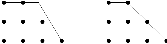
Fig. 2. Feasible sets of linear programs

On the left-hand side of Figure we have depicted the feasible set of the relaxed linear program (i. e. we have replaced x_1, x_2 \in \mathbb{N}_0 by x_1, x_2 \geq 0 ). The integral points are marked by filled circles. If we additionally require x_1 + x_2 \leq 3 we obtain the feasible set as depicted on the right-hand side of Figure 2.